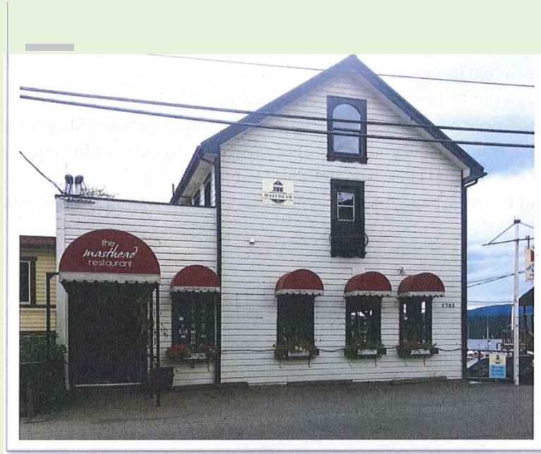
View of the Masthead from Cowichan Bay Road