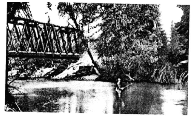
The original Koksilah River Truss Bridge