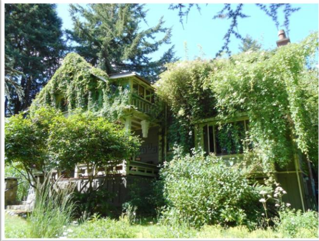
Front View of the Carlton Stone House