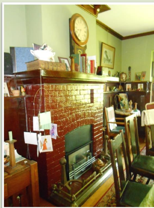
Interior View of an Original Fireplace