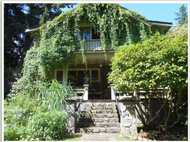
Front View of the Carlton Stone House