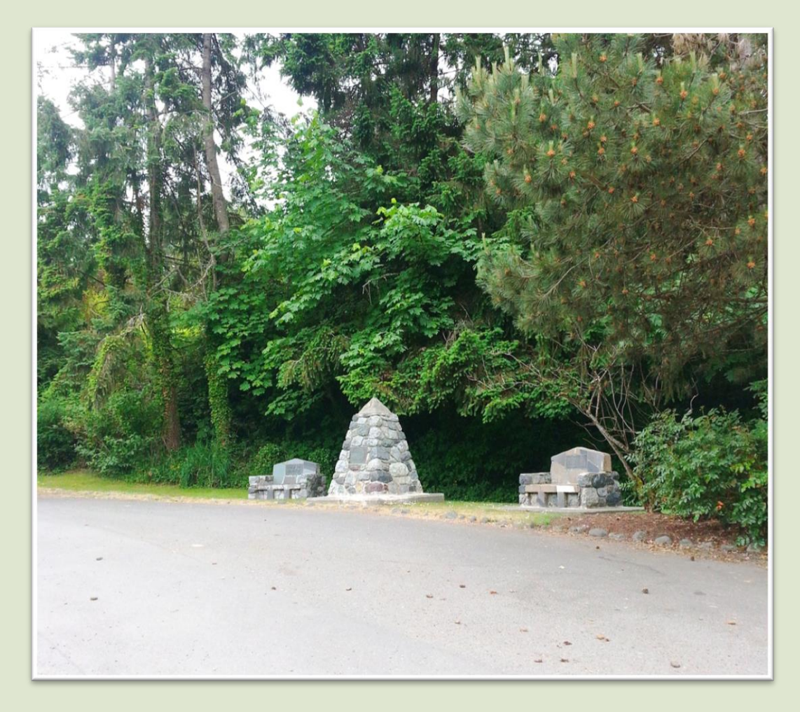
Side View of the Robert Service Memorial Park from Cowichan Bay Road