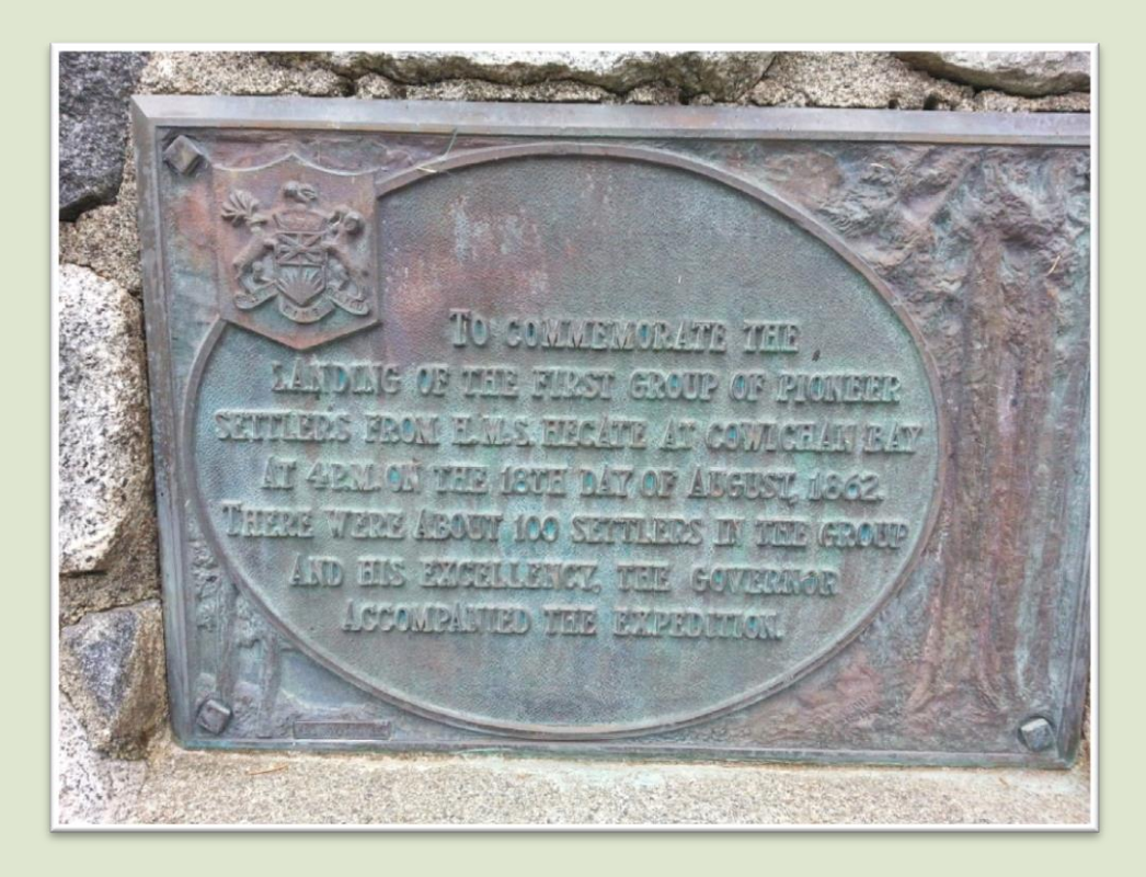
Stone Cairn Plaque (1958)