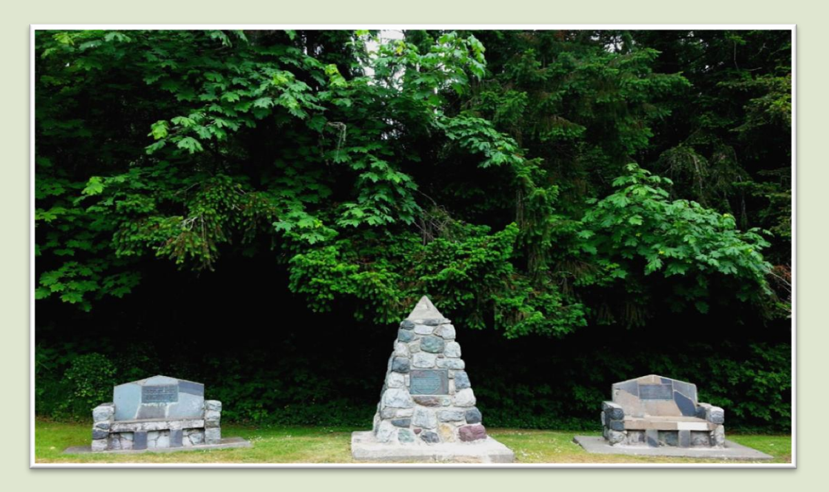
Front View of Park from Cowichan Bay Road