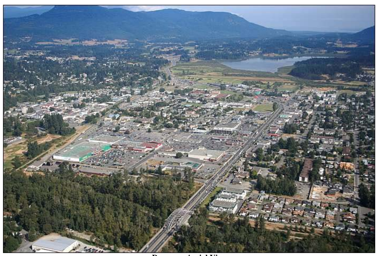
Duncan - Aerial View