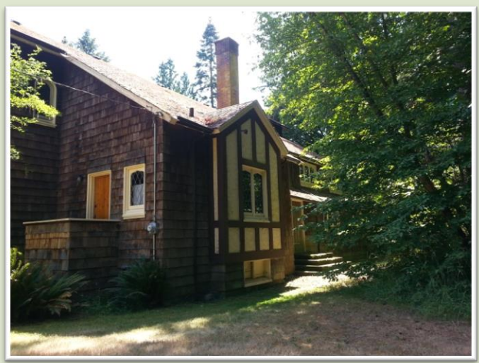
Front View of the Chapel