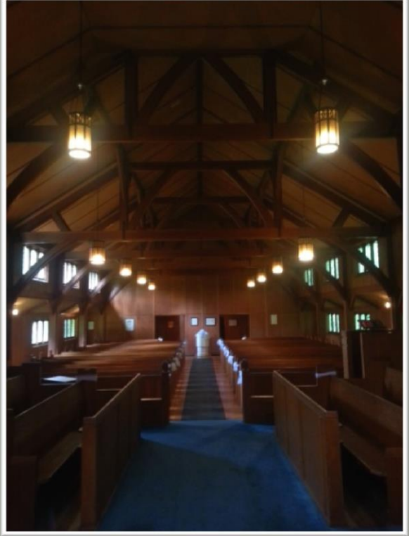
View towards the Altar